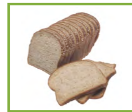
bread and pastries