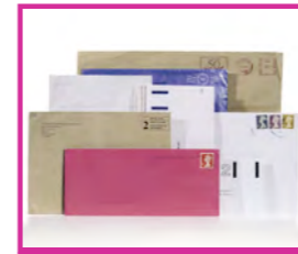
envelopes without windows