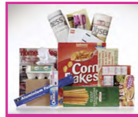
paper and cardboard