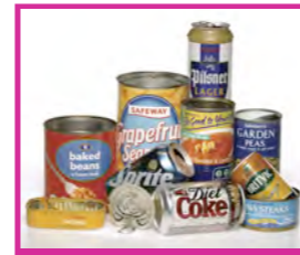
aluminium and steel cans