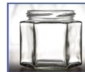
glass jars without lids