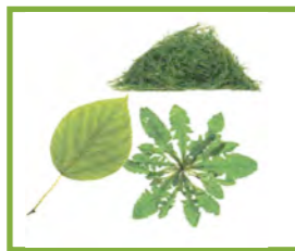
grass, weeds and leaves