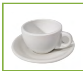
tea bags, loose tea and coffee