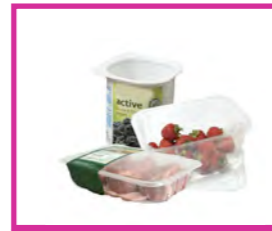
Plastic food packaging*