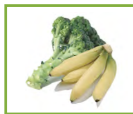
fruit and vegetables