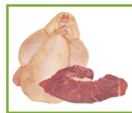
all meat and bones