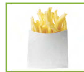
paper and card soiled with food