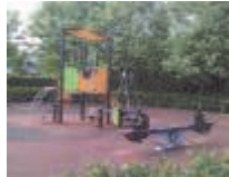
Play area, Old Farm Park

Parish councils can do these things by providing the services themselves, or by helping someone else (such as a charity) financially to do so. Walton Parish Council takes just £20,000 per year