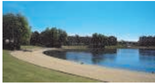
Caldecotte Lake flats

Walton Parish Council, over the past 8 years has been vocal, prominent and successful in campaigning with residents against the contentious development plans put forward at Caldecotte Lake, Old Farm Park,