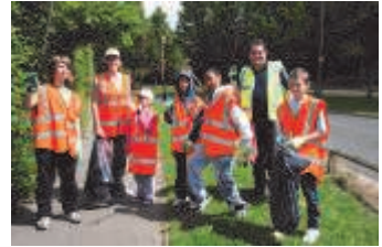
Volunteers at a clean-up day

How to join us Simply turn up on the day, just before 11am—we're meeting at the blue youth shelter on Hindhead Knoll for a briefing on the day. We start at 11am prompt.