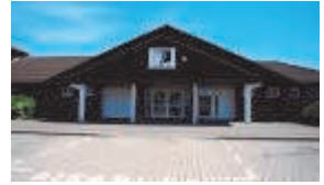
Heronsbrook Meeting Place

The Parish Council is not political and serves no